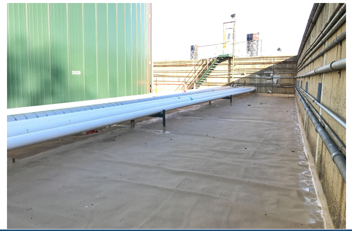
American Coating Technologies, LLC